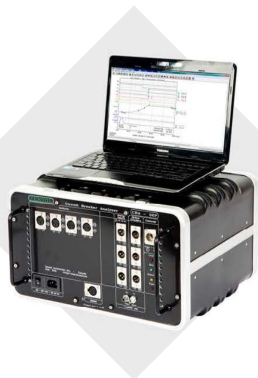
CBA-32P 8 CONTACTS