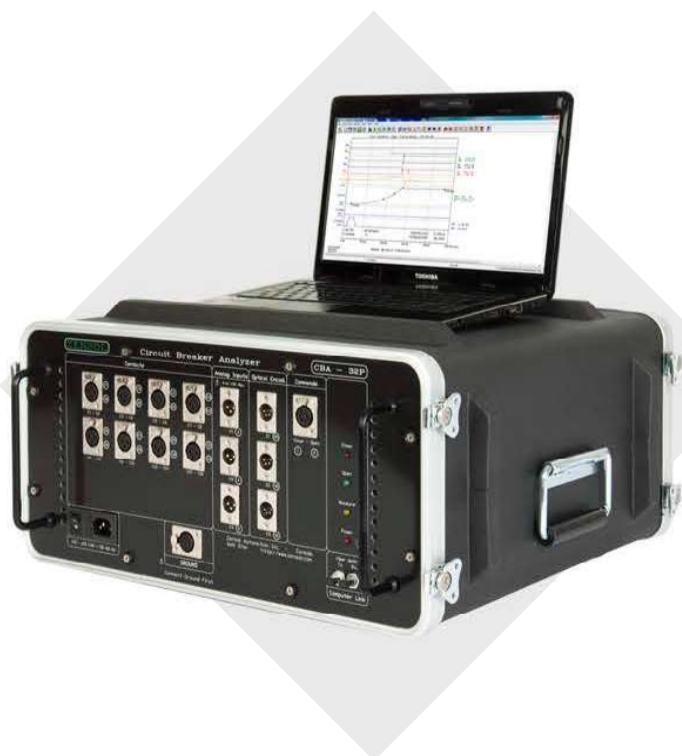
CBA-32P 16 CONTACTS